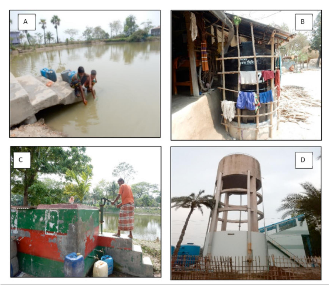
Figure.2. Different drinking water sources in the study areas (A: Collection of pond water for drinking; B: Plastic container for rainwater harvesting; C: Pond Sand Filter (PSF); D: Deep tube well with the overhead tank for water treatment).